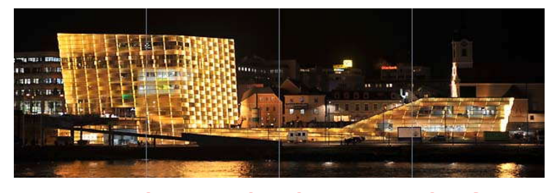
INFORMATION OF THE PROJECT